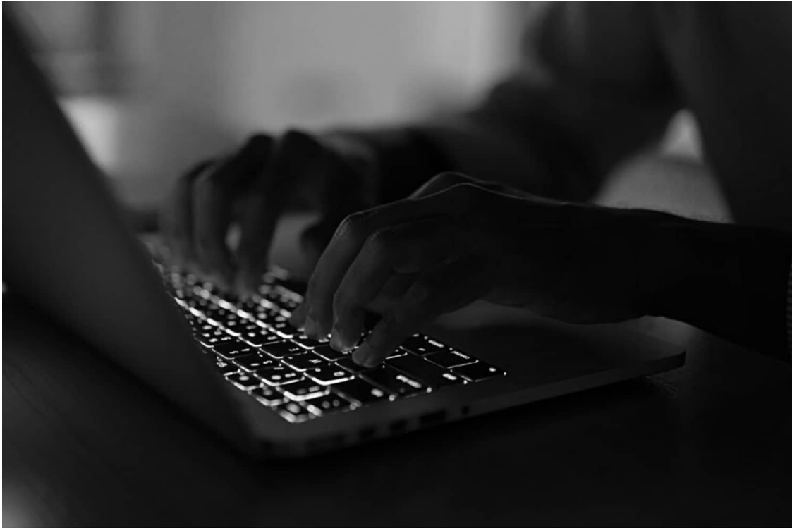
Hacker Movies.